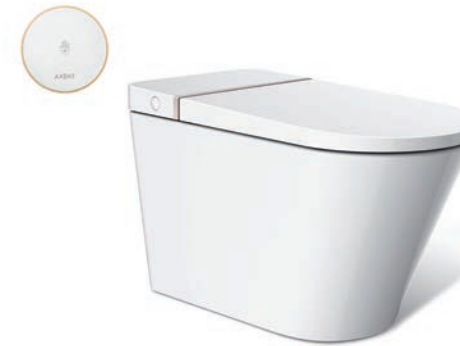
Primus Tankless toilet with Smart Flush