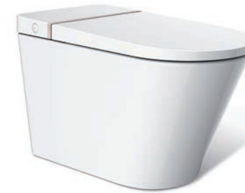
Primus Tankless toilet

Primus Smart Flush has an integrated sensor that activates the flushing mechanism without you having to touch it. Simply wave your hand in front of the sensor and Primus Smart Flush takes care of the rest automatically.